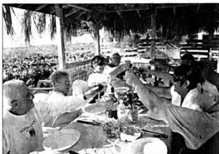
'Old Florida' feel: Guests share a beachside table at The Cedar Cove Resort & Cottages, with tiki huts and suites with tropical décor.

On this Friday, a manatee swims lazily at Lefliss Key nature preserve at the island's southern tip. A sand-castle-building competition is underway in Bradenton Beach. Near the island's midpoint, a group of white-haired women sit in white plastic chairs at the Cafe on the Beach to share wacky games of contract bridge