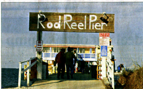
Fish and chips: The Rod & Reel Pier on the northern tip of Anna Maria Island is home to an affordable seafood restaurant and a great spot to angle for snook and redfish.